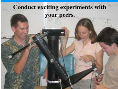
Conduct exciting experiments with your peers.

• Visit local research centers, such as the Stanford Linear Accelerator Center