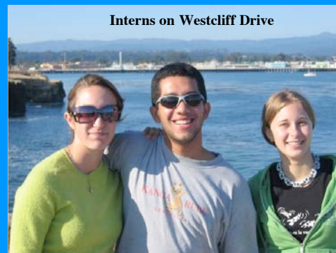
Interns on Westcliff Drive

During this five week course, you have the option to live at the dorms on the beautiful UC campus in sunny Santa Cruz!