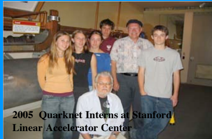
2005 Quarknet Interns at Stanford Linear Accelerator Center

QUARKNET provides dedicated students with a unique opportunity to work side-by-side with outstanding researchers and university faculty. This one of a kind course covers topics in physics that extend far beyond the typical high school curriculum.